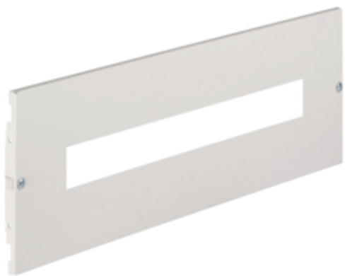
MCB kit, quadro.system, 200x600 mm 24 mod