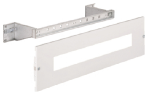
MCB kit, quadro.system, 150x600 mm 24 mod