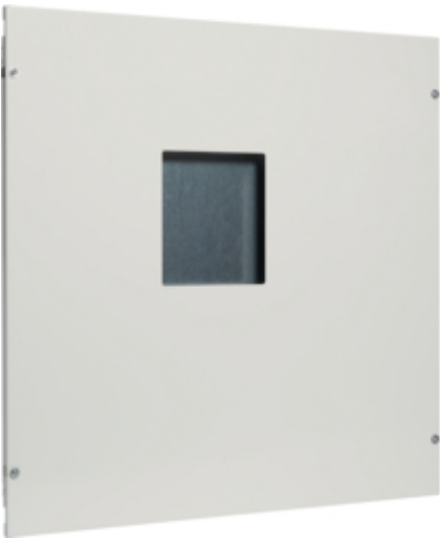
Vertical insulated MCCB kit h800/1000, quadro.system, 600x600 mm