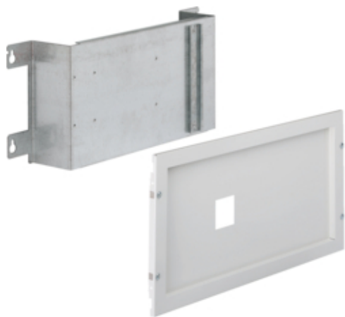
Operating switch kit, quadro.system, HA250/400 A 600x300 mm