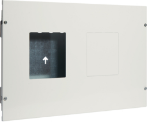
Vertical MCCB motorized kit, quadro.system, h400/630A 600x400 mm