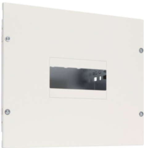
Vertical MCCB kit, quadro.system, x250 350x300 mm