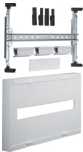
Kit, universN, 300x500mm, for 4 MCCB 160A