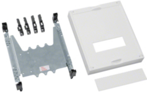
Kit, universN, 300x250mm, for MCCB x250A