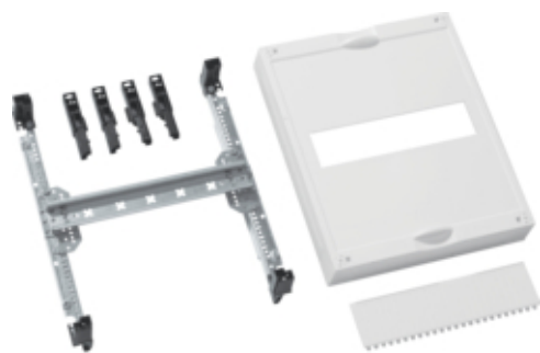
Kit, universN, 300x250mm, for 2 MCCB x160A